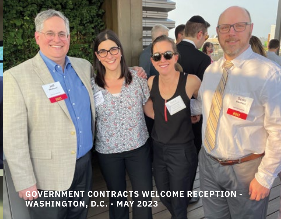
GOVERNMENT CONTRACTS WELCOME RECEPTION - WASHINGTON, D.C. - MAY 2023