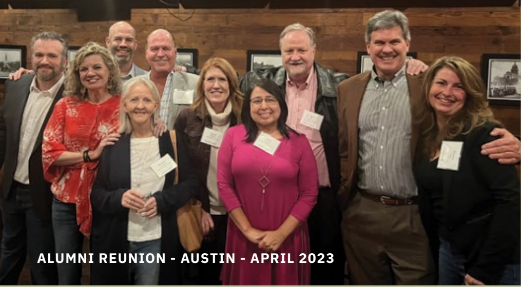
ALUMNI REUNION - AUSTIN - APRIL 2023