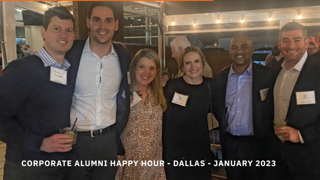
CORPORATE ALUMNI HAPPY HOUR - DALLAS - JANUARY 2023