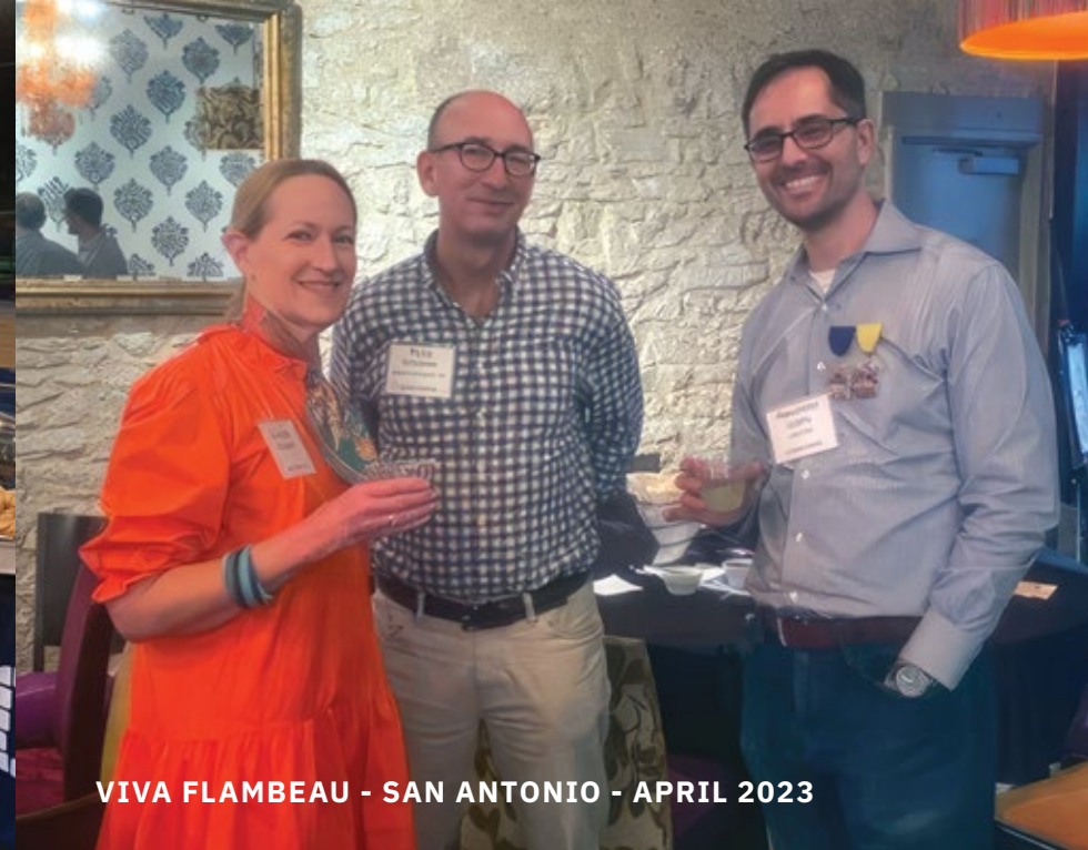
VIVA FLAMBEAU - SAN ANTONIO - APRIL 2023