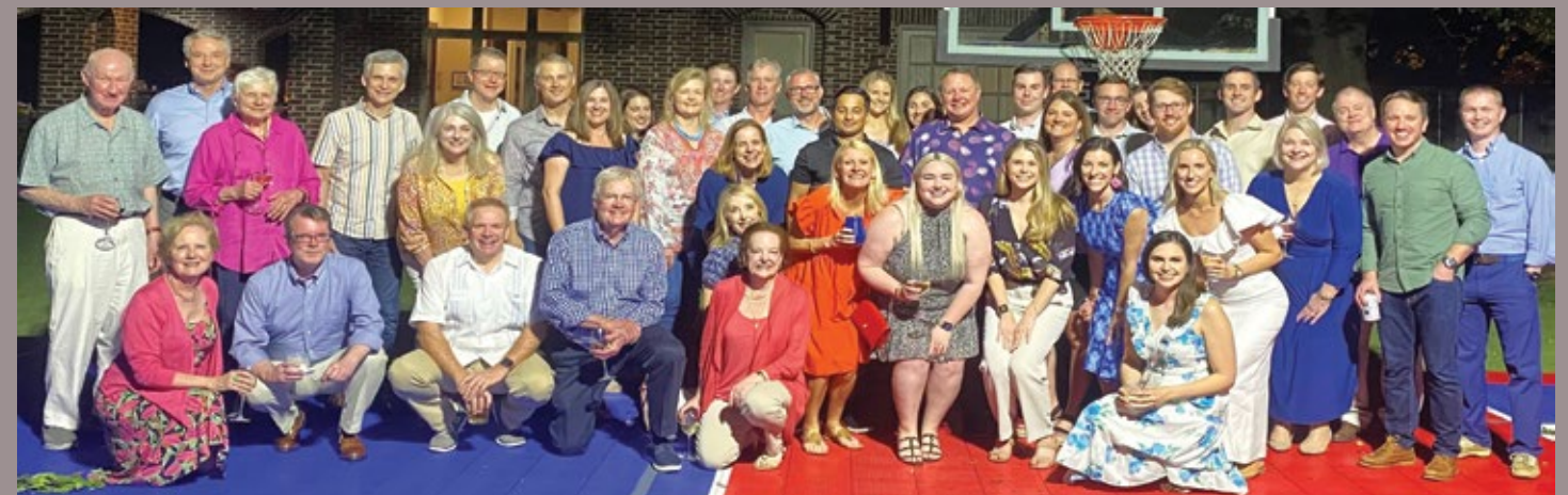
WHITE COLLAR ALUMNI PARTY - DALLAS - MAY 2023