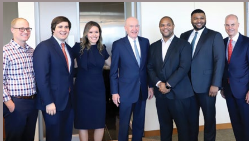
BUILDING LEADERS - DALLAS - JUNE 2023