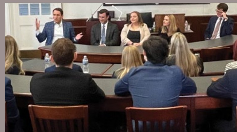
SUMNERS SCHOLARS EVENT - DALLAS - MARCH/APRIL 2023